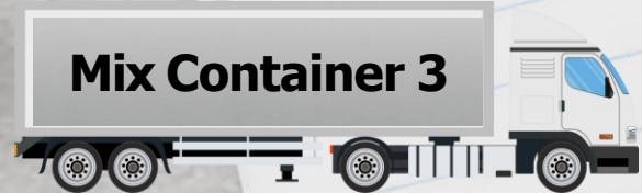
Mix Container 3