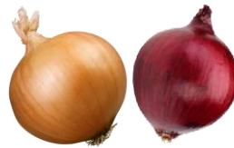
RED & YELLOW ONIONS

PACKAGING: 10KG, 25KG COUNT/SIZE: 45 TO 100 ORIGIN: EGYPT AVAILABILITY : APR TILL SEP