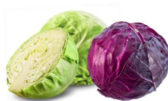
WHITE & RED CABBAGE

PACKAGING: 1KG / 10KG COUNT/SIZE: 20-35 34-50 ORIGIN: BELGIUM / HOLLAND AVAILABILITY : JUNE TILL MARCH